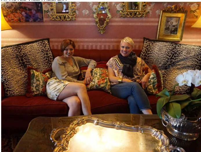
AT HOTEL VILLA ABBAZIA