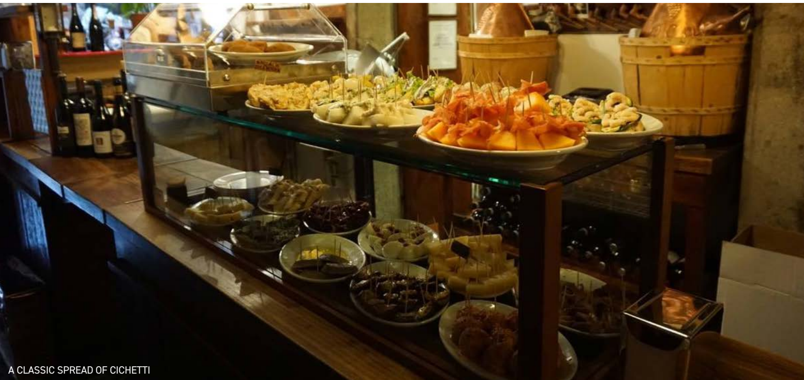
A CLASSIC SPREAD OF CICHETTI

Contact Onward Travel with questions or special requests: letsgo@onwardtravel.co 845-293-2729