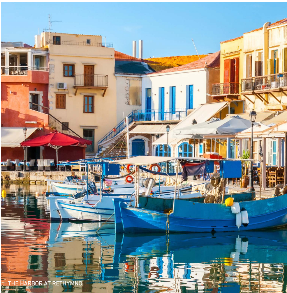
THE HARBOR AT RETHYMNO