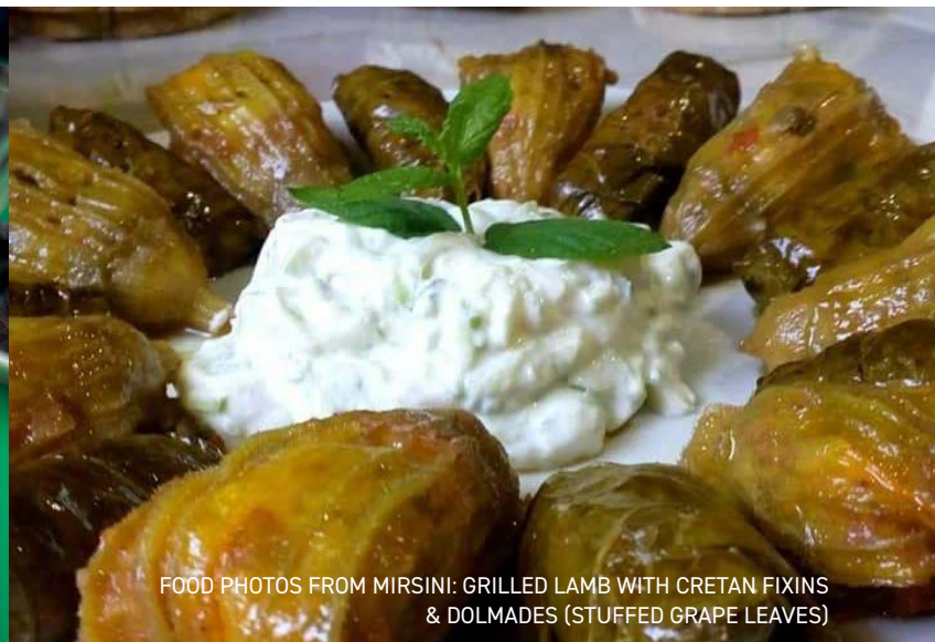
FOOD PHOTOS FROM MIRSINI: GRILLED LAMB WITH CRETAN FIXINGS & DOLMADES (STUFFED GRAPE LEAVES)