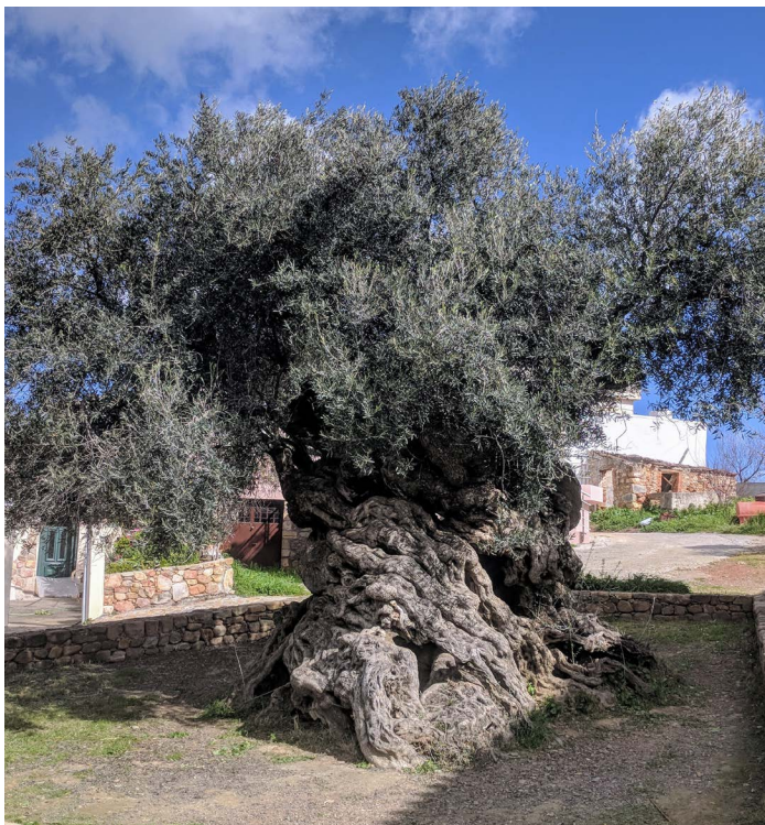
POSSIBLY THE OLDEST OLIVE TREE IN THE WORLD