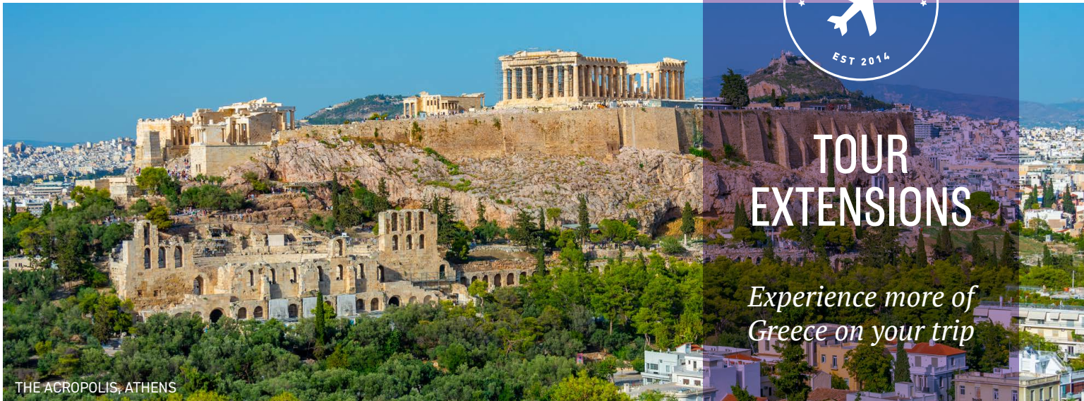
THE ACROPOLIS, ATHENS