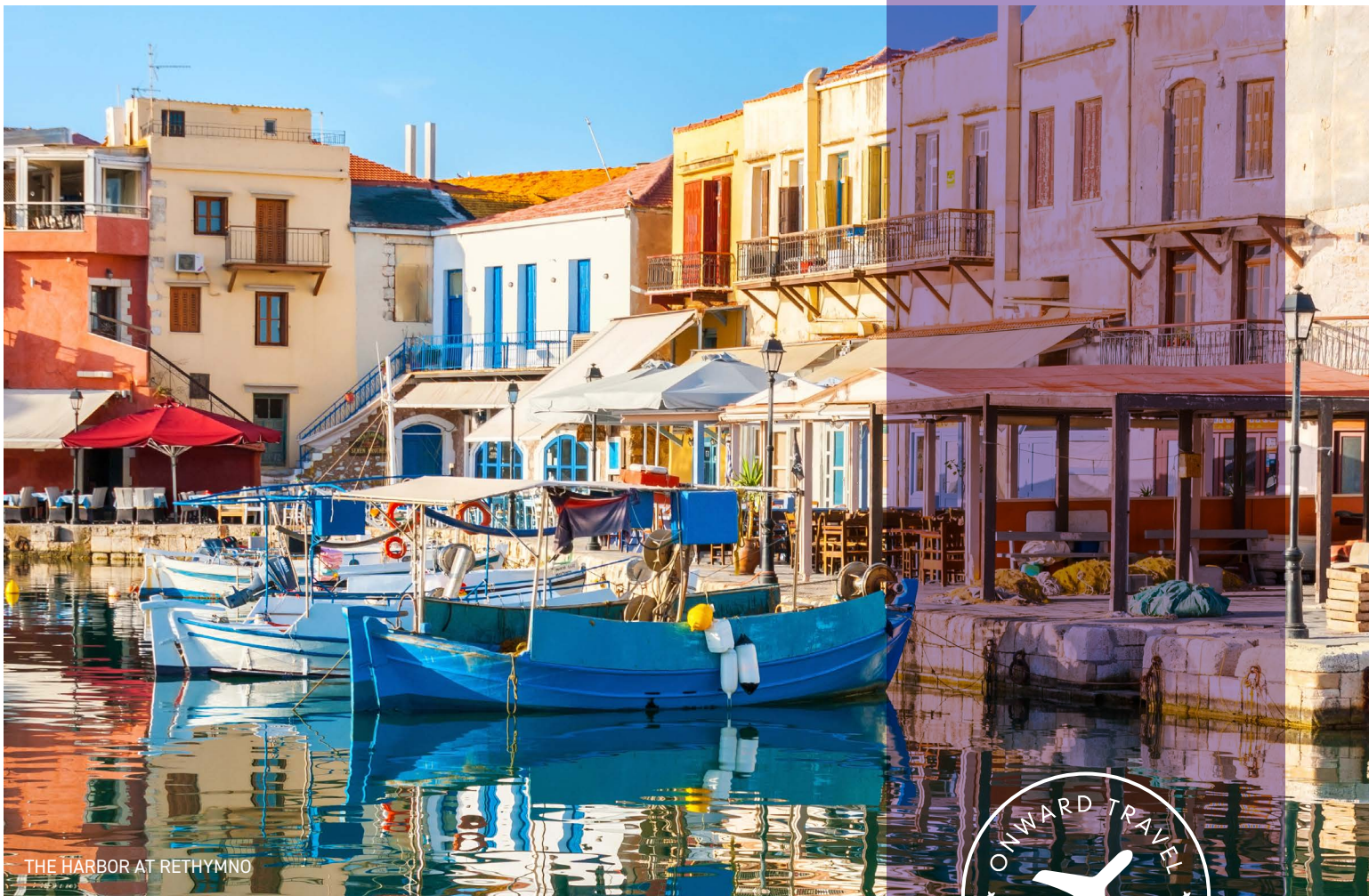
THE HARBOR AT RETHYMNO

Onward Travel is thrilled to add Crete to our repertoire for 2025. We'll spend a week on this idyllic Aegean island, the largest of the Greek archipelago, and one-time center of the ancient Minoan civilization.