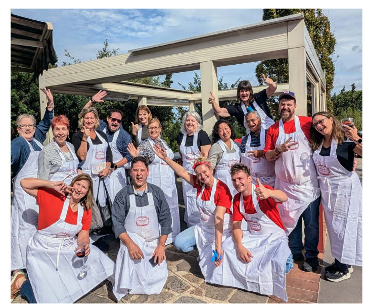
POSING WITH THE TEAM FROM MACELLERIA CECCHINI IN PANZANO