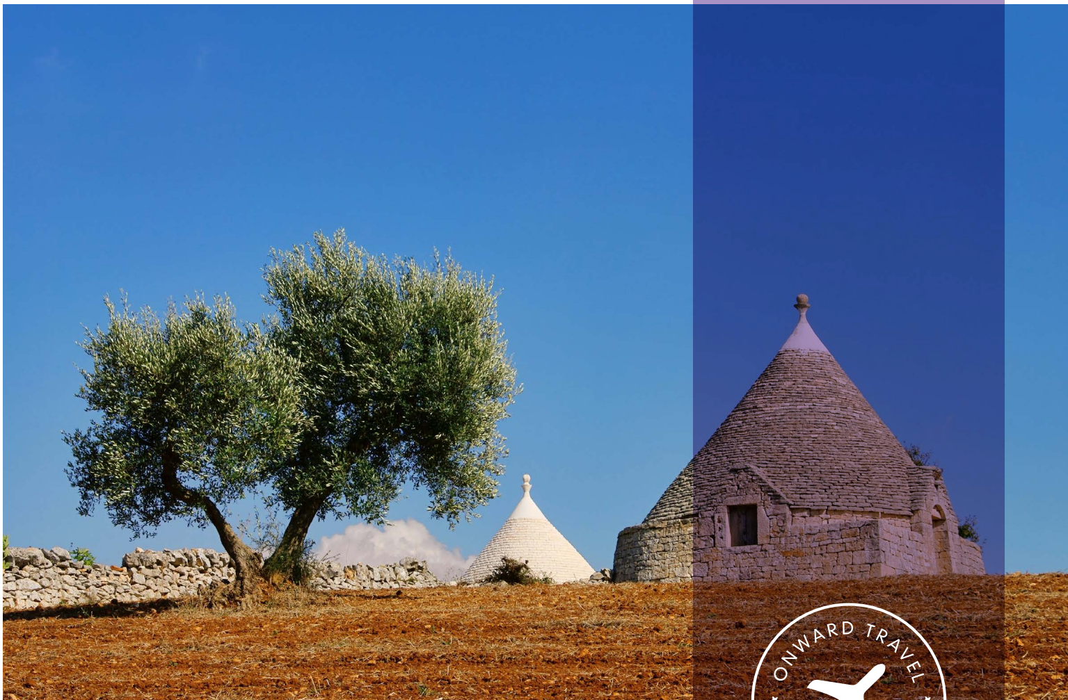
OLIVE TREES HAVE BEEN GROWING IN PUGLIA FOR OVER THREE THOUSAND YEARS