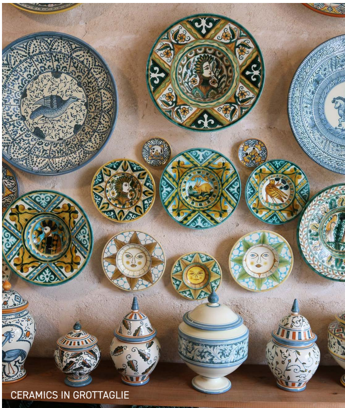
CERAMICS IN GROTTAGLIE