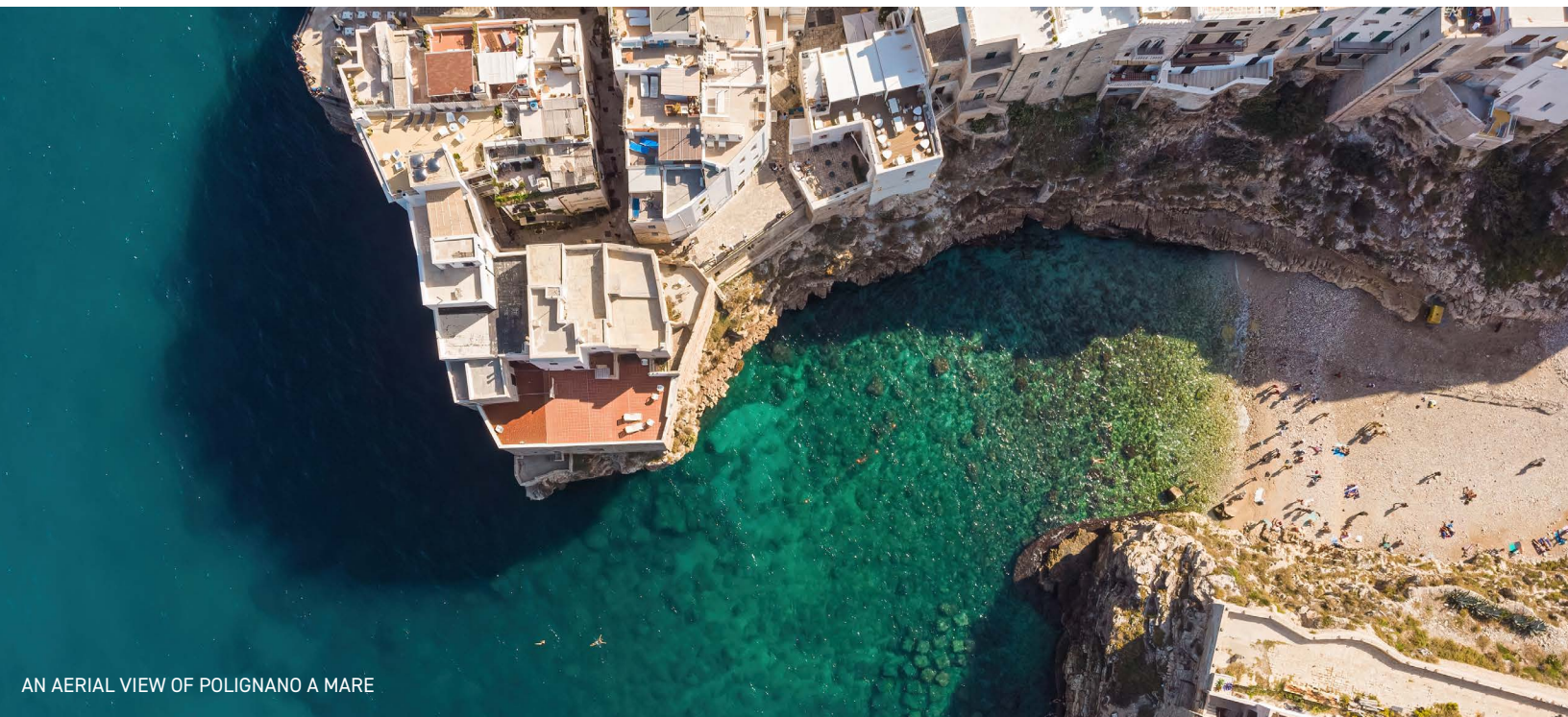
AN AERIAL VIEW OF POLIGNANO A MARE

Contact Onward Travel with questions or special requests: letsgo@onwardtravel.co 845-293-2729