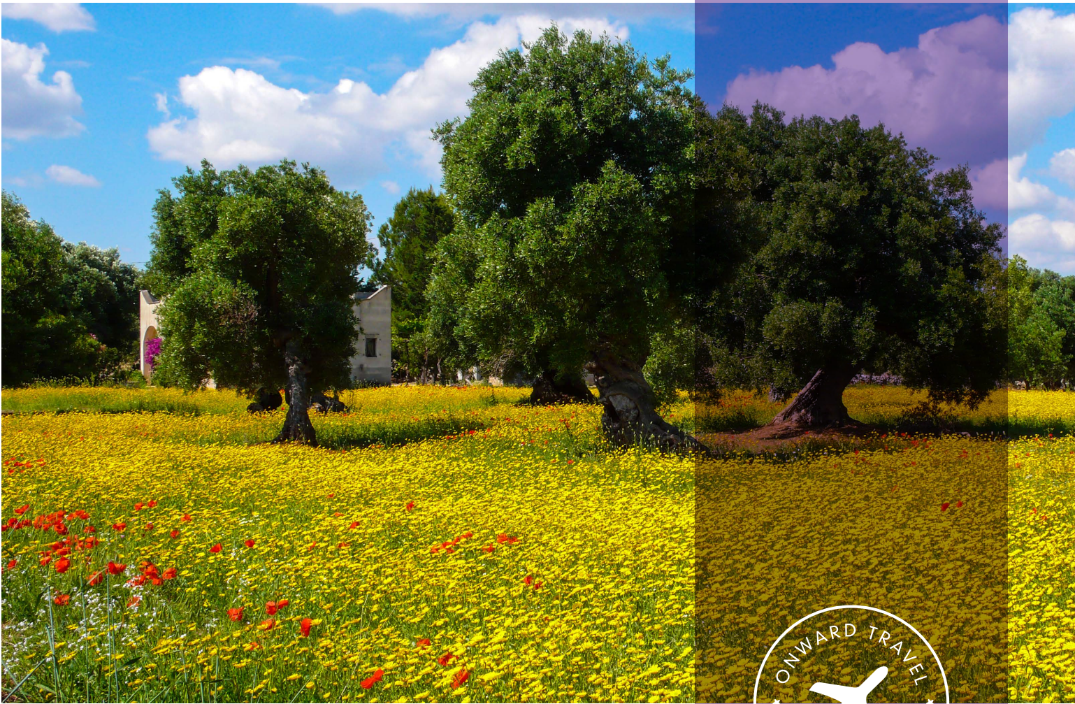
OLIVE TREES HAVE BEEN GROWING IN PUGLIA FOR OVER THREE THOUSAND YEARS