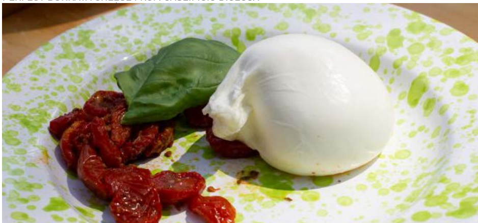
PERFECT BURRATA CHEESE FROM CASEIFICIO DICECCA