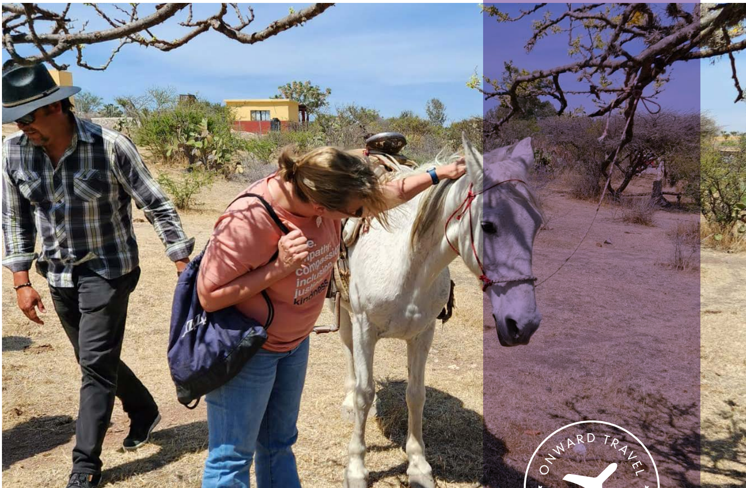
COVER: THE NEO-GOTHIC CHURCH PARROQUIA DE SAN MIGUEL ARCÁNGEL'S DRAMATIC PINK TOWERS RISE ABOVE THE MAIN PLAZA, EL JARDÍN.

HERE, SUZAE SAYS HELLO TO A FRIENDLY HORSE AFTER LUNCH ON THE RANCH.